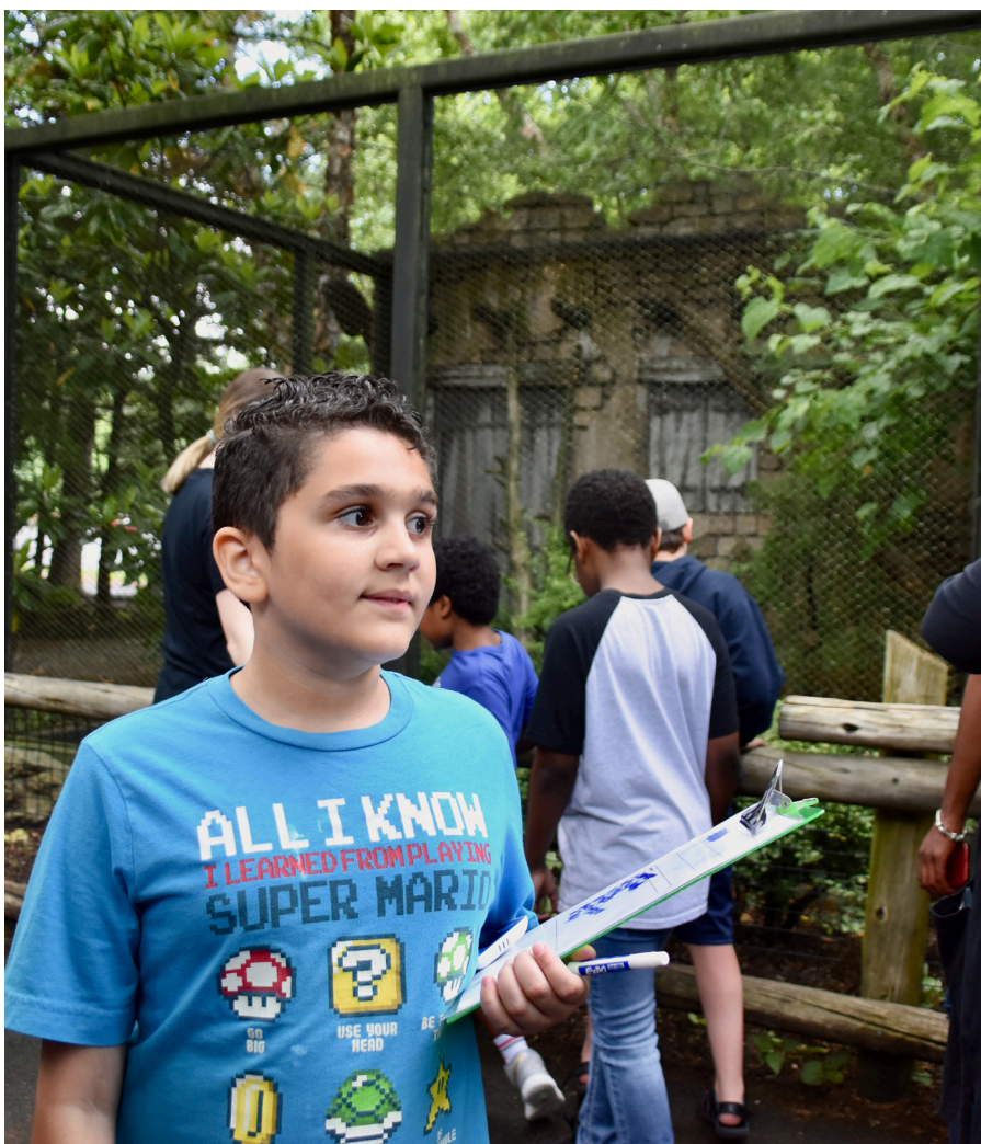
Pictured: On a school-wide field trip this June, SBJC's Maywood Campus students visited the Bergen County Zoo in Paramus.

The first step of the accreditation process was to survey stakeholder groups from all across the district. The results were then analyzed by the district Planning Team—twenty-two volunteer teachers, paraprofessionals, therapists, and administrators. SBJC then used that information to identify four key areas that would be the focus of our strategic plan. A more in-depth look into these strategies can be found on the next page.